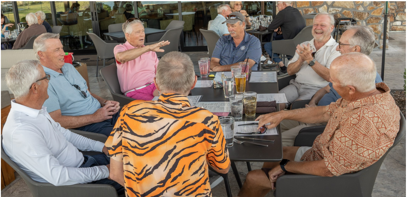
And ... The Stories Begin